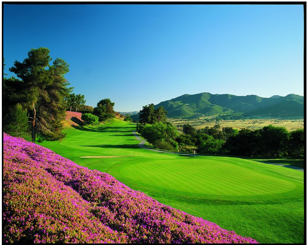
11th Hole Pala Mesa Golf Resort

Proceeds benefit our partnership with St. Catherine's Food Pantry Pala Mesa Golf Resort, Fallbrook CA Friday, September 18, 2015 11:30 a.m. Check-in 1:00 p.m. Shotgun Start